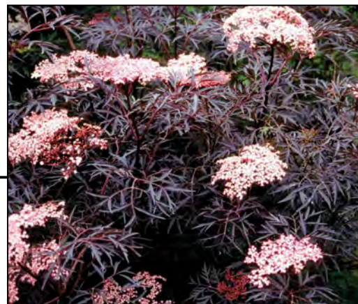
Elderberry - Sambucus nigra 'Black Lace'