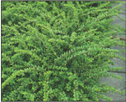
Box Honeysuckle - Lonicera nitida 'Maigrun'