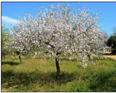
Almond - 'All In One' Alt. - Flowering Cherry