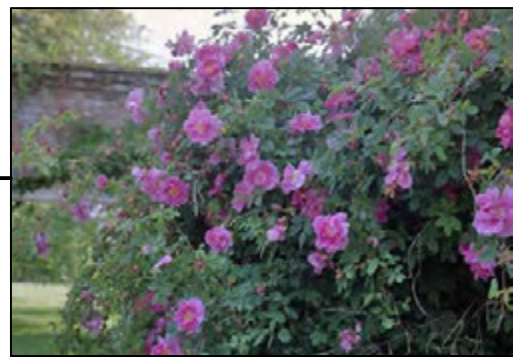
Wild rose - Rosa californica