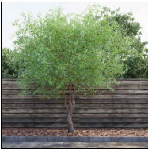
Curly Willow - Salix matsudana 'Tortuosa'