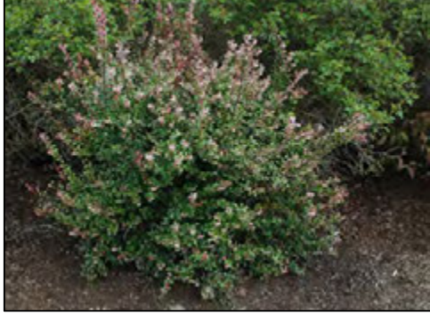
Huckleberry - Vaccinium ovatum