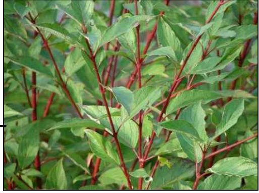
Western Dogwood - Cornus sericea occidentalis