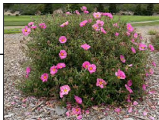
Rockrose - Cistus x purpureus