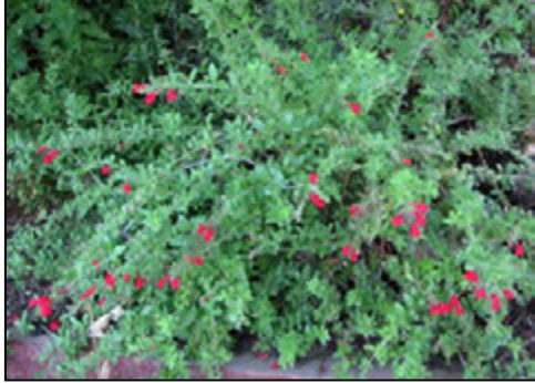
Island Snapdragon - Galvezia speciosa