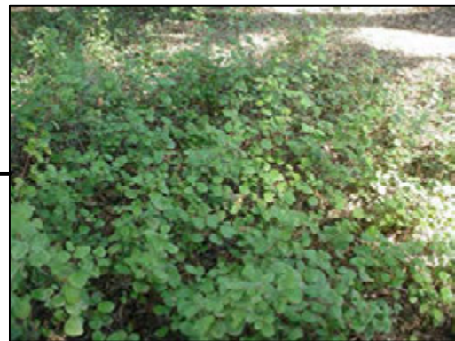
Catalina currant - Ribes viburnifolium