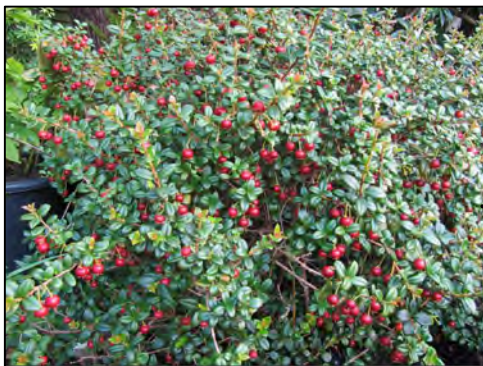
Chilean Guava - Ugni molinae