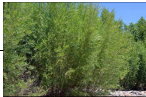
Sandbar Willow - Salix exigua