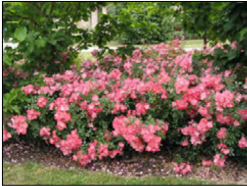
Rosa x 'Flower Carpet Pink Splash'