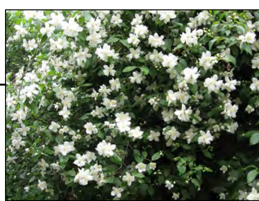
Mock Orange - Philadelphus lewisii 'Goose Creek'